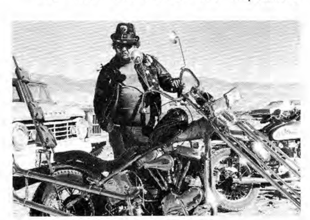
Said he worked in 5000.

machinery. The smallest, minibikes, run about 50cc and are raced by 11- and 12-year-old kids, usually children of members. Biggest run to the snorting, highly-tuned, 500cc jobs specially designed for motorcross racing—lots of power, very little weight, with components ruggedized for a beating.